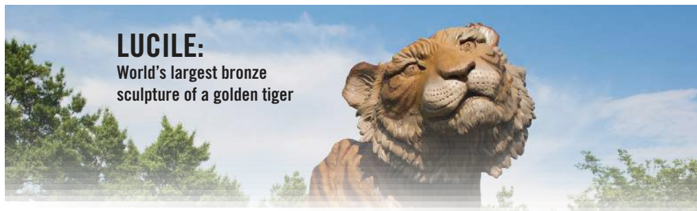
LUCILE: World's largest bronze sculpture of a golden tiger